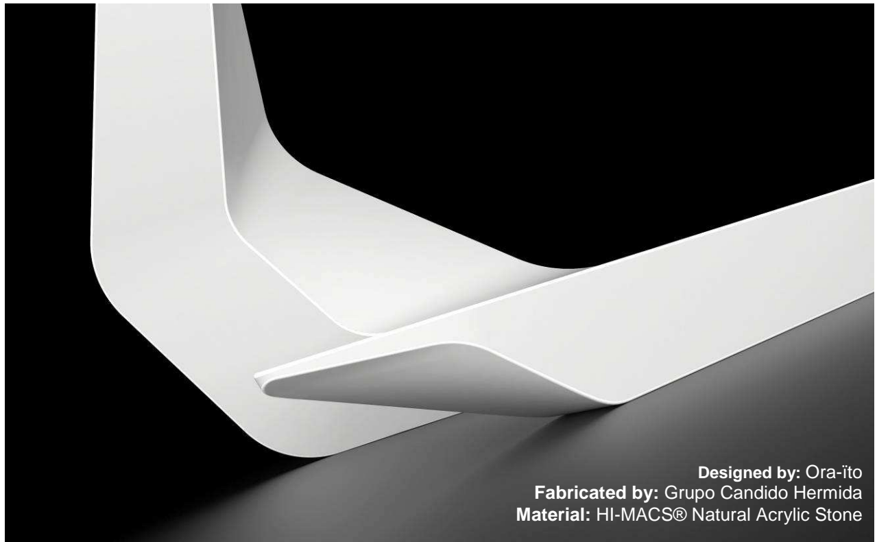
Designed by: Ora-ïto Fabricated by: Grupo Candido Hermida Material: HI-MACS® Natural Acrylic Stone

For the occasion of 100% Design London, scheduled for 23 - 26 September 2010, HI-MACS® and worldwide famous designer Ora-ïto, will be presenting a monumental piece of art inspired by the limitless possibilities of HI-MACS®.